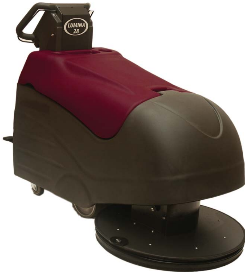
Lumina ™ 28 28" Battery Burnisher